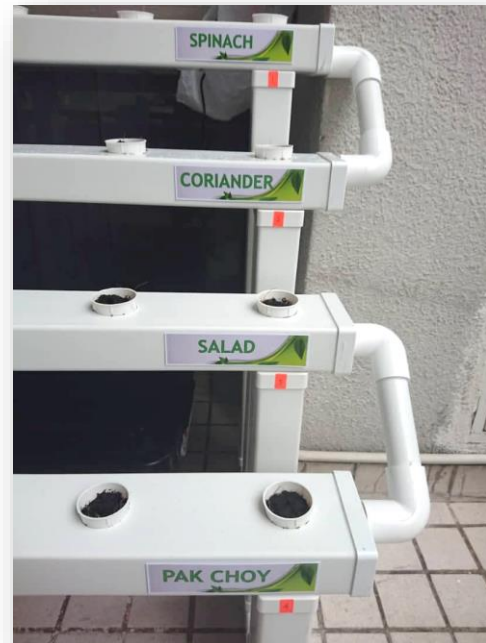
One of the 18 systems assembled by Group Corporate Communications & Administration