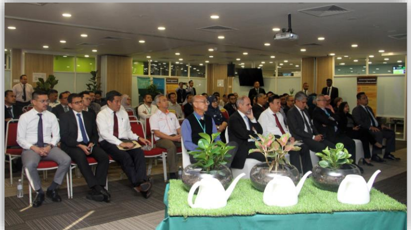
Participants of Boustead Sustainability Day 2018