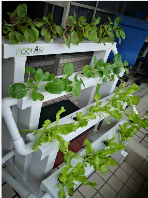
The hydroponic system