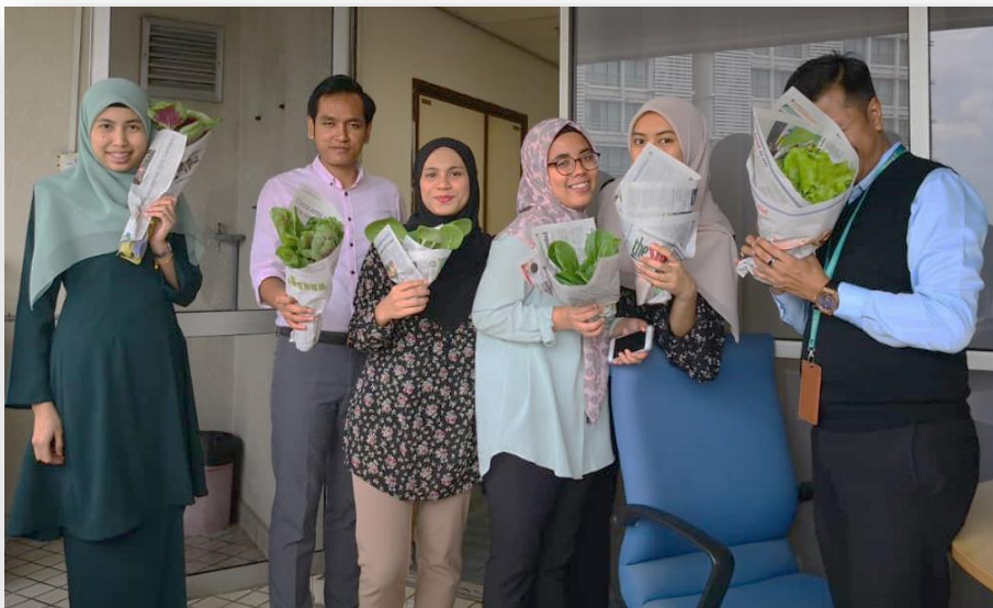
Happy faces of Corporate Planning Department when they get to take home the harvested vegetables