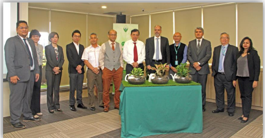
Group picture with the Senior Management Team of Boustead Group and United Nations Malaysia team